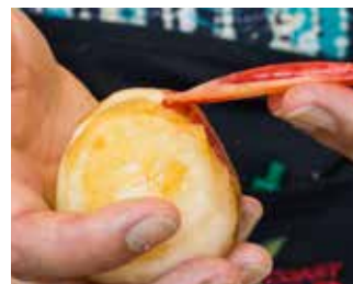
Peach skins being gently peeled.