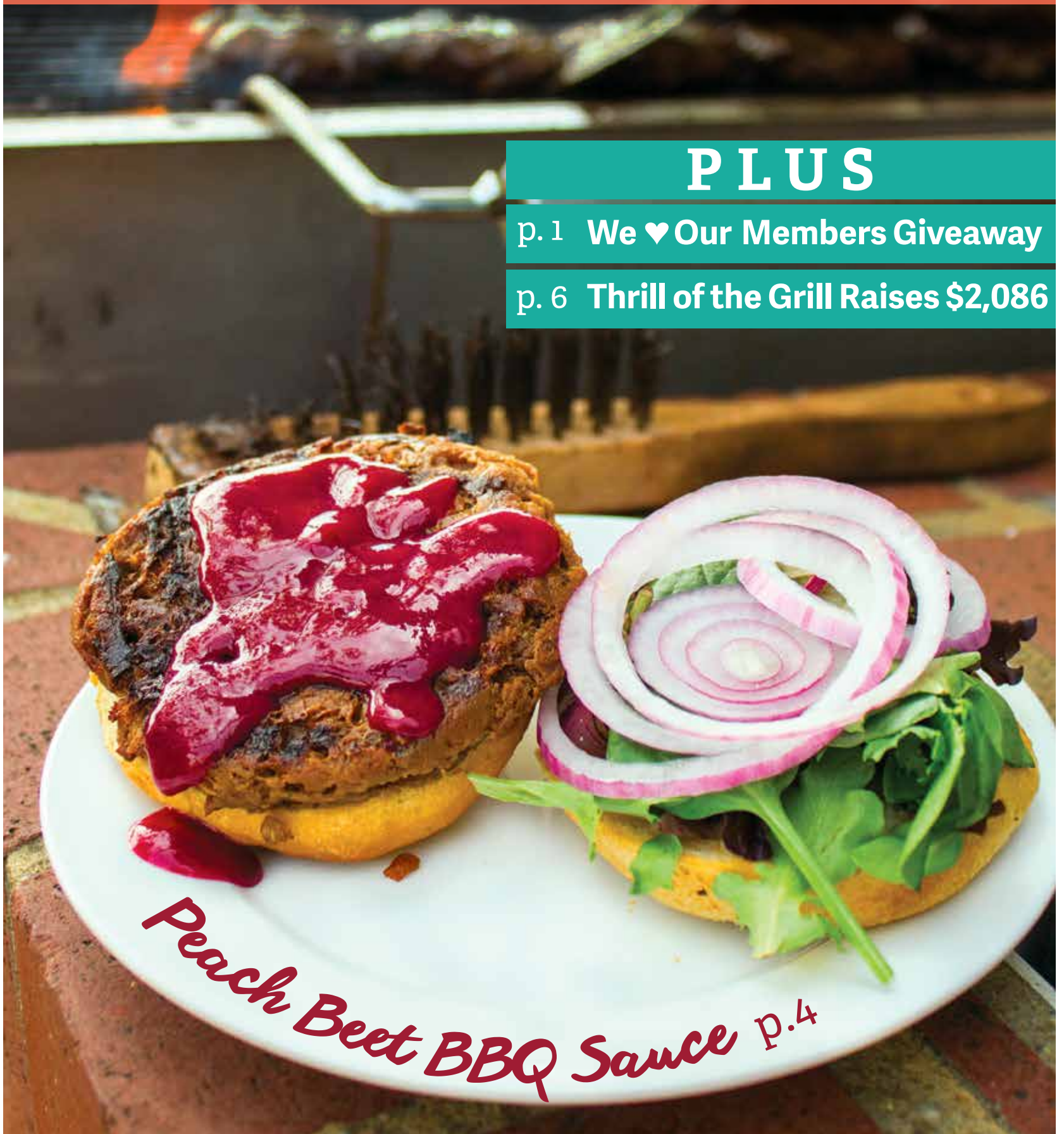
Peach Beet BBQ Sauce p.4

CO-OP NEWS NORTH COAST CO-OP 811 I STREET ARCATA, CA 95521