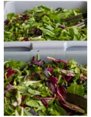
Salad greens donated by Earl's Organic Produce.