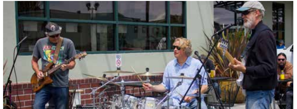
Local band Dogbone entertains the crowd with their jazzy tunes.