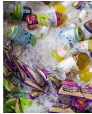
Donated drinks fill an ice tub.