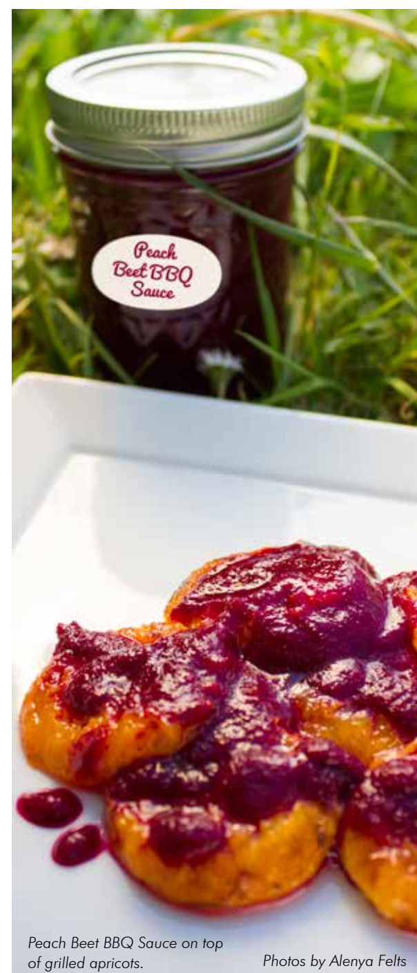
Peach Beet BBQ Sauce on top of grilled apricots.