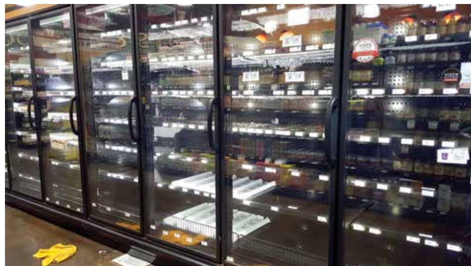
Bare shelves in the frozen department of North Coast Co-op's Eureka store during the refrigeration and freezer system failure.

Initially, we anticipated being without refrigeration in our Eureka store for two to four days, which would have been a huge inconvenience for shoppers stocking up for Memorial Day—and Kinetic Sculpture Race—weekend and a significant loss in sales. However, our Maintenance team had the issue resolved and the refrigeration running within 24 hours! Our staff worked cooperatively and diligently to get coolers and freezers restocked as quickly as