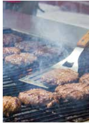
Beef patties donated by Humboldt Grassfed Beef.

Special acknowledgement to: Co-op employees, Food for People, New Directions, our local vendors and reps and all of the volunteers that made this event a success — Thank You!